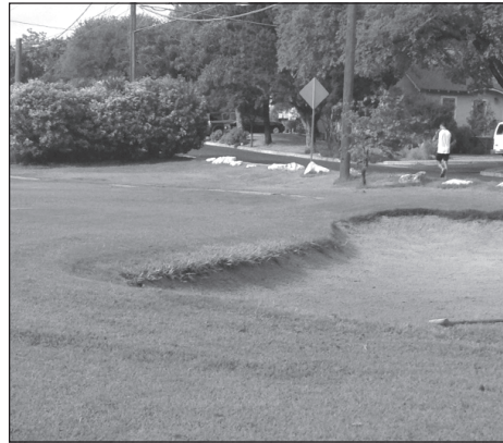
Hancock Golf Course

Protect Environmentally Sensitive Areas and Integrate Nature into the City seeks to improve environmental, recreational and transportation functions and improve the connection between people and the environment; NOW THEREFORE,