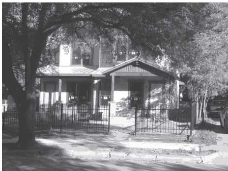
Duplex at 718 Harris Avenue

Email us at StopStealthDormsatx@gmail.com or visit STOPSTEALTHDORMS.com and sign the petition.