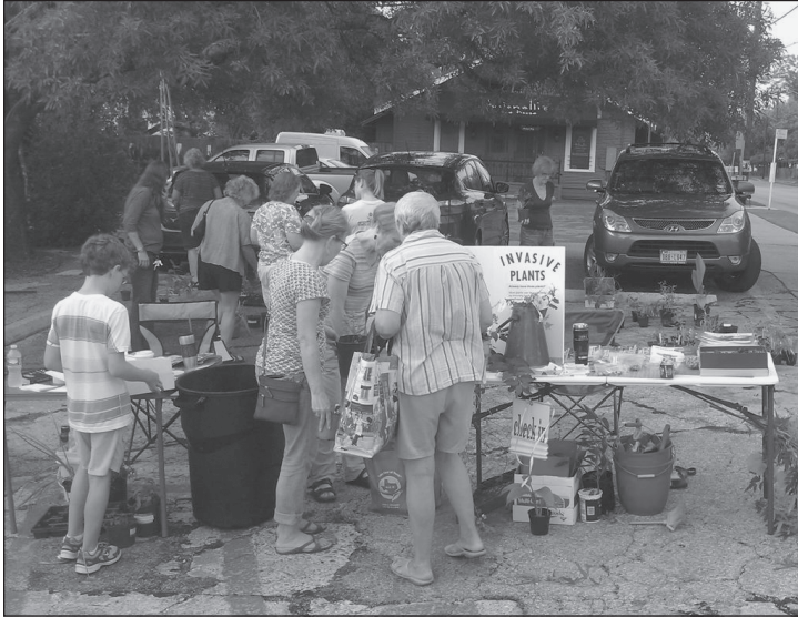
Neighborhood Plant Swap

Thanks to everybody who came to the September Plant Swap, helped with the swap, donated, and people who talked about it in person, via email, and Facebook.