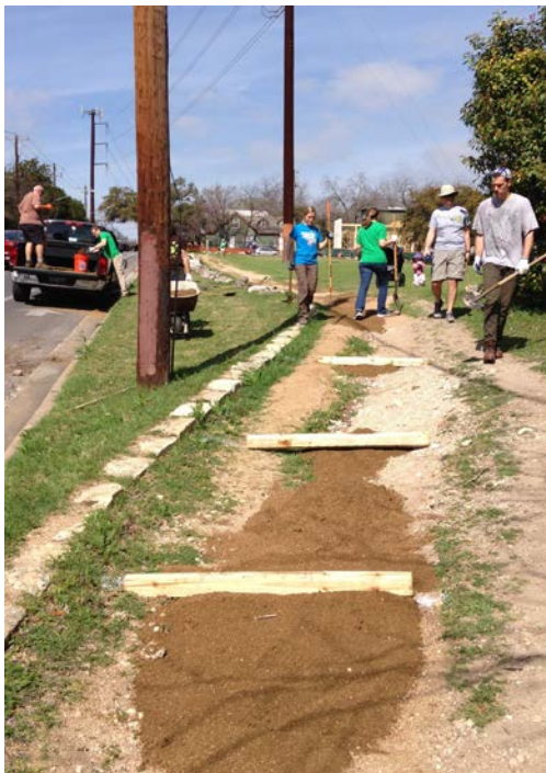
Just beginning work